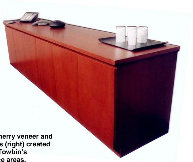
One of a series of cherry veneer and hardwood credenzas (right) created for C.E. Unterberg, Towbin's executive conference areas.

Datamation provides a wide range of material and fabrication resources to meet the millwork and operational furniture requirements of interior designers. This project for C.E. Unterberg, Towbin's new Manhattan headquarters includes stainless steel, aluminum, glass, hardwood veneer and plastic laminates, in addition to made-to-measure modular mail center and technology support furniture.