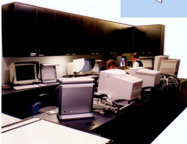
Individual computer workstations and overhead storage cabinets complete a built-to-fit installation.

For additional information please call Datamation Systems: (201) 329-7200 or (212) 732-3824 FAX (201) 329-7272